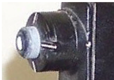
Figure 5. American Optical Model 12603—measurement nose

Figure 5 shows the measurement nose of an American Optical Model 12603 Lensometer, the successor (in 1969) to the Model 603.