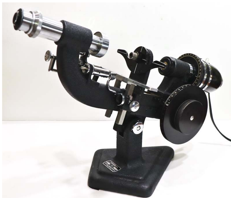
Figure 1. American Optical M603 Lensometer

Figure 1 shows a typical M603 Lensometer (this one in fact from our personal collection, made in 1948).