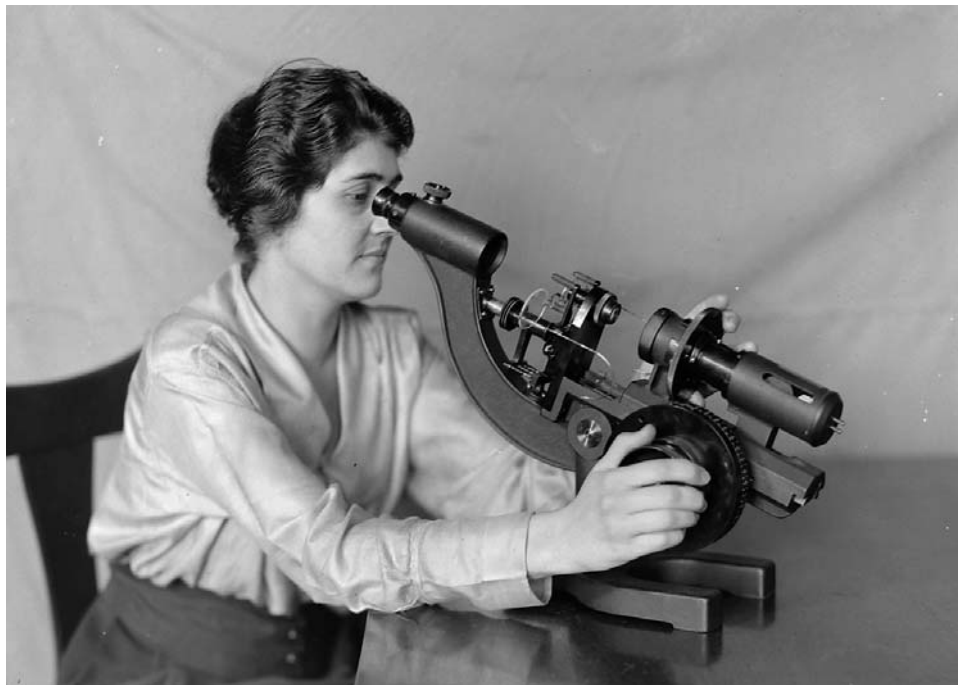
Figure 6. American Optical Wellsworth Lensometer

We believe that this was in fact implemented on the earliest commercial American Optical Lensometer, the Wellsworth Lensometer, seen in figure 6 in a charming photo from a catalog ca. 1920: