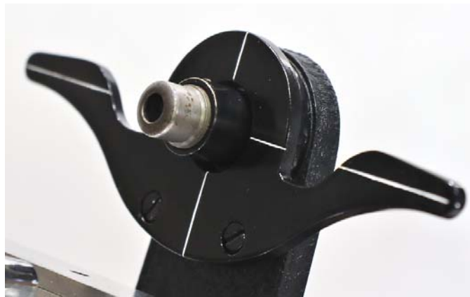
Figure 2. Lens alignment plate (“mustache”)

Many M603 Lensometers 3 were equipped with a mustache-shaped lens alignment plate (which for conciseness I will call here the mustache ). In figure 2 we see close-up the one on the specimen seen above.