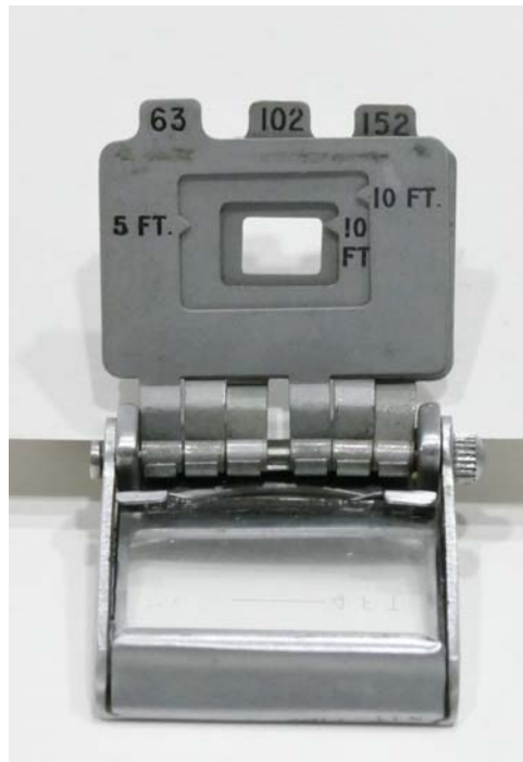
Figure 8. Type F adapter masks

The masks are held on the shaft by little loops, reminiscent of the tabs on a hinge leaf. The tabs from the three masks must coexist on the shaft, and so for each mask the tabs are in one of three positions, positions that of course cannot be occupied by tabs in that position on any other currently mounted mask.