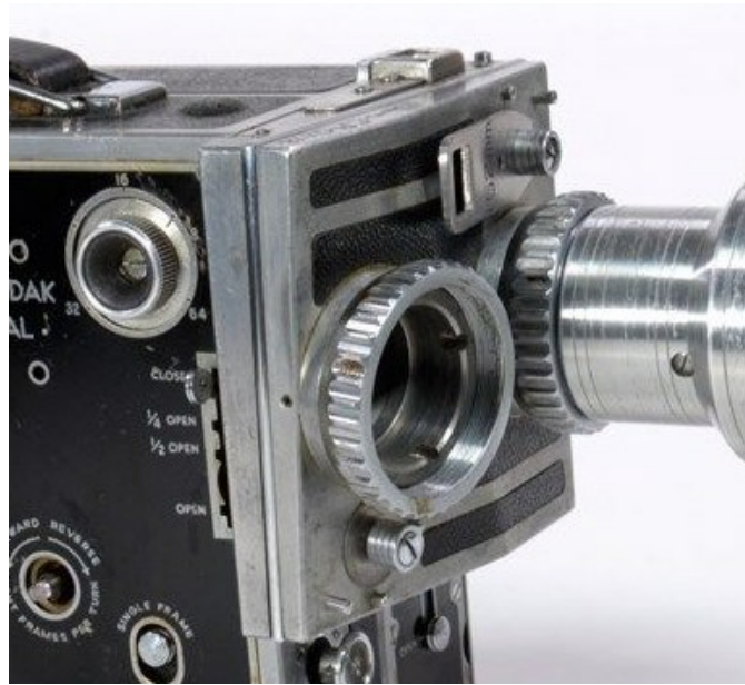
Figure 12. Type S mounts on a Ciné-Kodak Special II

The Ciné-Kodak Special II (like the Ciné-Kodak Special) has a two-position lens turret. In the figure we see the "active" turret position equipped with a lens, and the other turret position without one, so the details of the camera side of the Type S mount can be seen again.