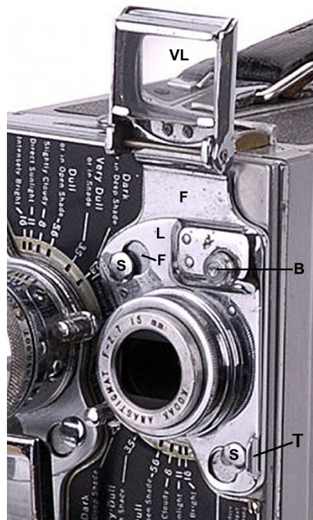
Figure 2. Lens mount on Ciné-Kodak Special

We see mostly the lens that is in the "active" position on the turret, in this case a 15 mm f/2.7 lens (a common "moderate wide angle" lens for 16 mm Ciné-Kodak, where 25 mm is considered the "normal" focal length). But on the left, we see, in part, the lens in the "inactive" position.