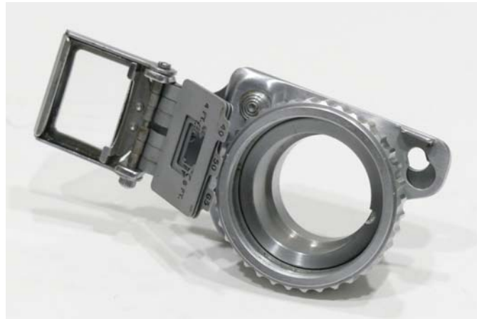
Figure 4. Type P adapter configured for 25-mm taking lens

Now suppose that this user also has a 40 mm S-mount lens. To give the viewfinder the proper field of view to match the field of view of the camera with this lens aboard, the user folds up a little mask on the adapter, which reduces the field of view of the viewfinder to match that of the camera with the 40 mm taking lens in place. We see that in figure 5.