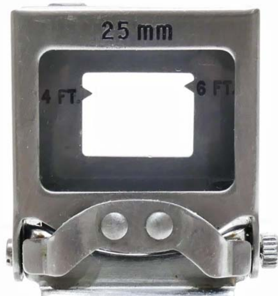
Figure 9. Type P adapter with 40 mm mask in place

No suppose that in a type P adapter we erect the 40 mm mask, to use a 40 mm lens on the camera. On that mask, there are two little pointer projections into the frame area on opposite sides, one labeled (in the frames margin) "4 FT" and one "6 FT". These again show us where the top of the taken frame would be in the viewfinder view for a subject at a distance of 4 feet or 6 feet. We see that in figure 9, which shows the 15 mm viewfinder lens of the Type P adapter with the 40 mm mask in place: 7