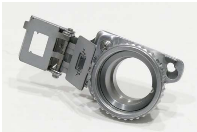
Figure 5. Type P adapter configured for 40-mm taking lens

Now suppose that this user also has a 40 mm S-mount lens. To give the viewfinder the proper field of view to match the field of view of the camera with this lens aboard, the user folds up a little mask on the adapter, which reduces the field of view of the viewfinder to match that of the camera with the 40 mm taking lens in place. We see that in figure 5.