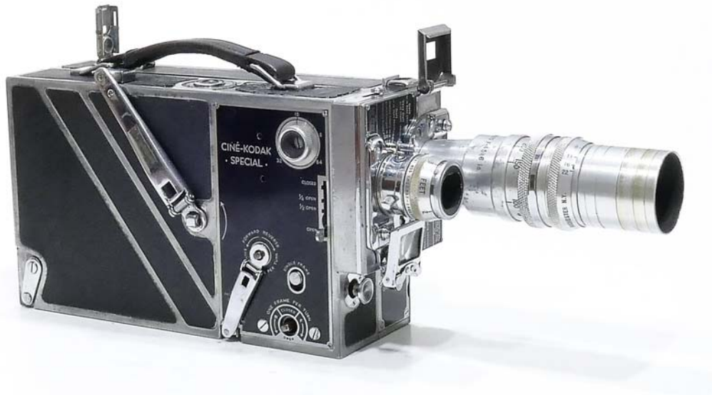
Figure 1. Ciné-Kodak Special camera

The Ciné-Kodak Special was a professional level 16 mm film camera with a wide range of features, introduced in 1933. For context, we see one in figure 1.