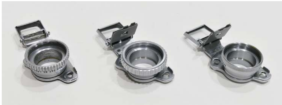
Figure 7. Types G, P, and F adapters (l to r)

Figure 7 shows the types G, P, and F adapters for review.