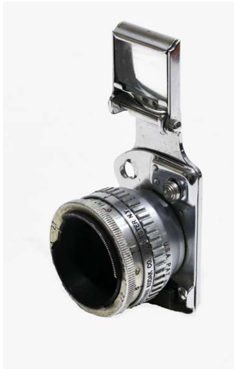
Figure 6. Type G adapter with 15 mm f/2.7 lens