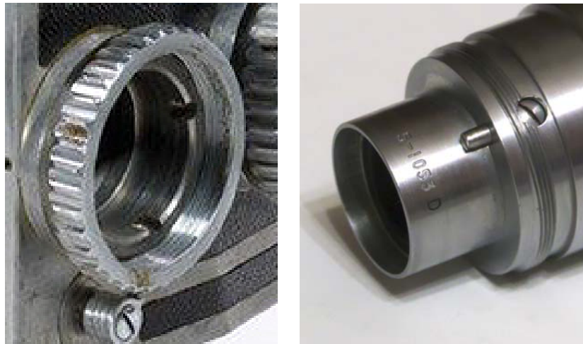
Figure 3. Typical S mount (l, camera side, r, lens side)

The new "universal" mount was designated the "Type S" mount. It is very straightforward. We see a typical camera side and a typical lens side in figure 3.